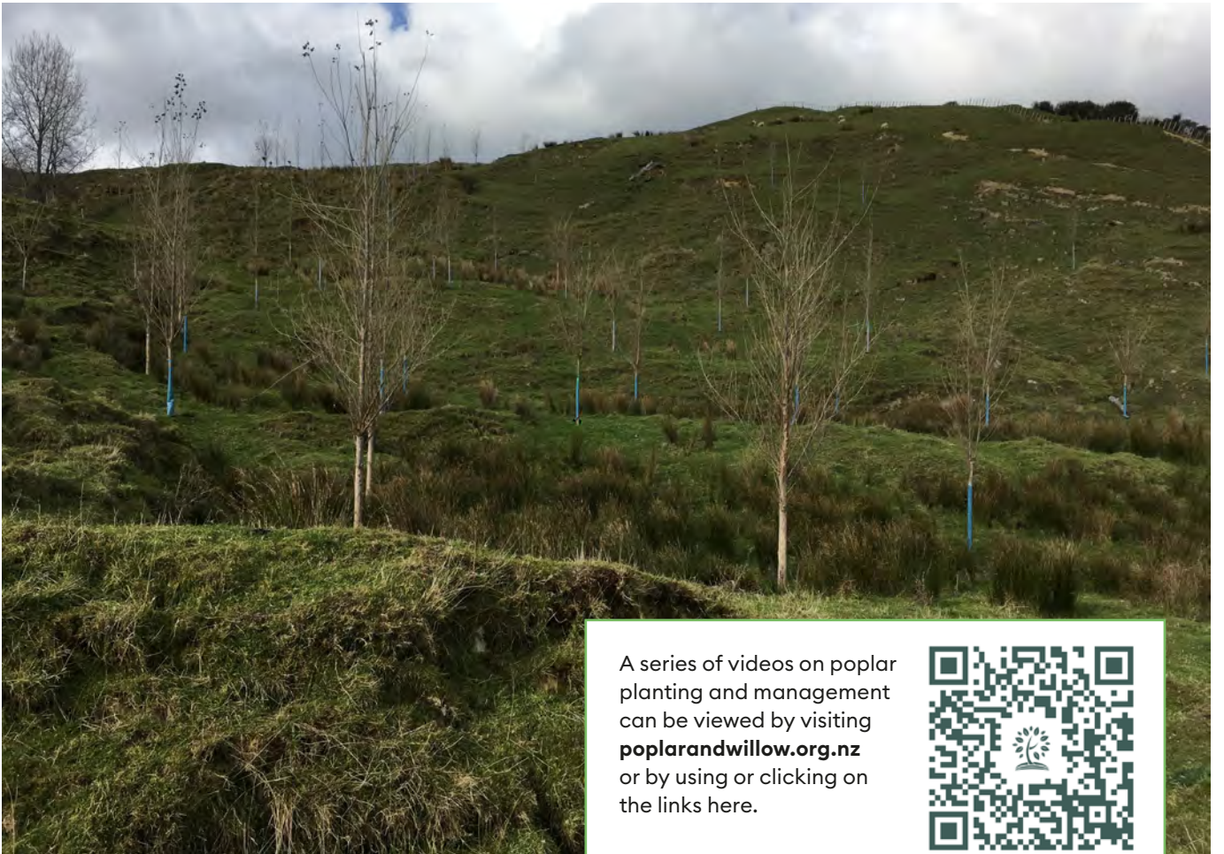
Field site year 3.