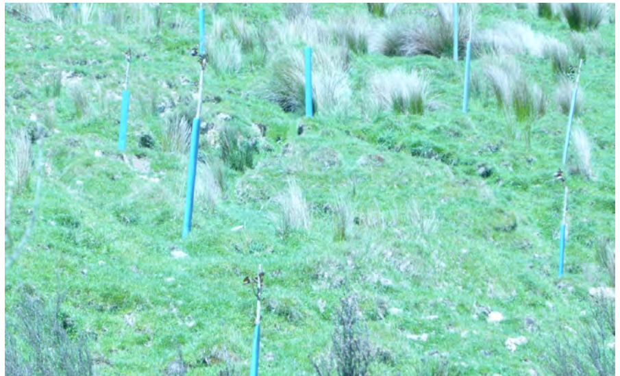
New shoots on poplar poles at the trial site two months after planting.

There was no evidence in any of the four years from height, collar diameter, top of sleeve diameter or fine root growth that the N and P fertiliser deposits acting singly or together enhanced survival or growth (Table 1, Figure 1). There was some evidence of enhanced leaf levels of the applied nutrients, though within the range of variability of other leaf nutrients (Table 2).