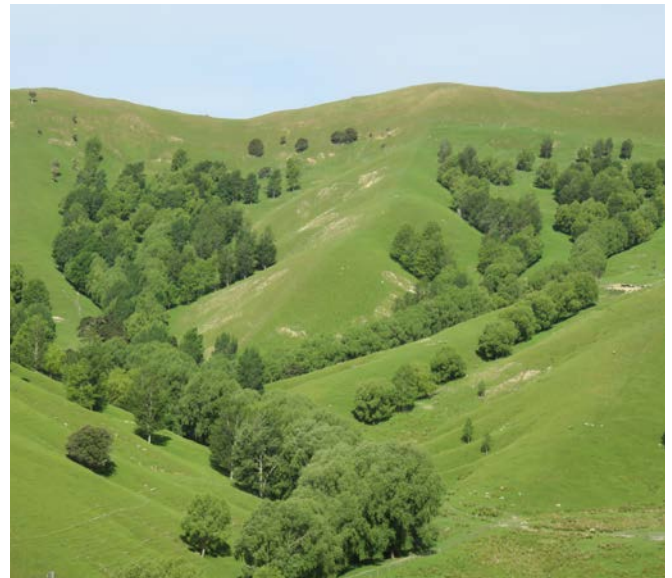
Poplars and willows preventing gully erosion