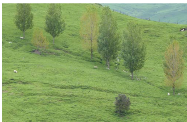
Different poplar varieties planted up a watercourse

Other management practices for erosion control to poplar and willow trees that were frequently mentioned in the questionnaires were planting of other trees such as native trees, pine trees, mānuka/kānuka trees, eucalyptus and shrubs. Seventeen of the 43 farmers did mention a plantation, e.g. pine, and this was the most frequent alternative measure reported in both regions. Other practices that were identified were fencing, shelterbelts, silt traps, detention dams in gullies, sediment control, drains, retirement/natural regeneration and adjustment of cultivation methods.