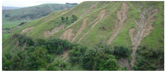
Hill slope erosion following a storm in Wairoa District

Table 1 shows the type of erosion farmers experienced on their farms, how often it occurred on farms, and when it was managed by planting poplar or willow trees.