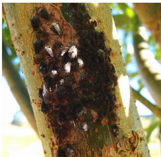
Giant willow aphid on 2-yr pole

Land movement and stock trampling both had significant effects on the immediate surroundings of the trees. Any soil movement tended to pile up around the tree trunk; stock trampling also pushed up the soil around the trunk. Both these effects meant errors arose with time when measuring collar diameter, since not all trees were affected equally. Consequentially, measures