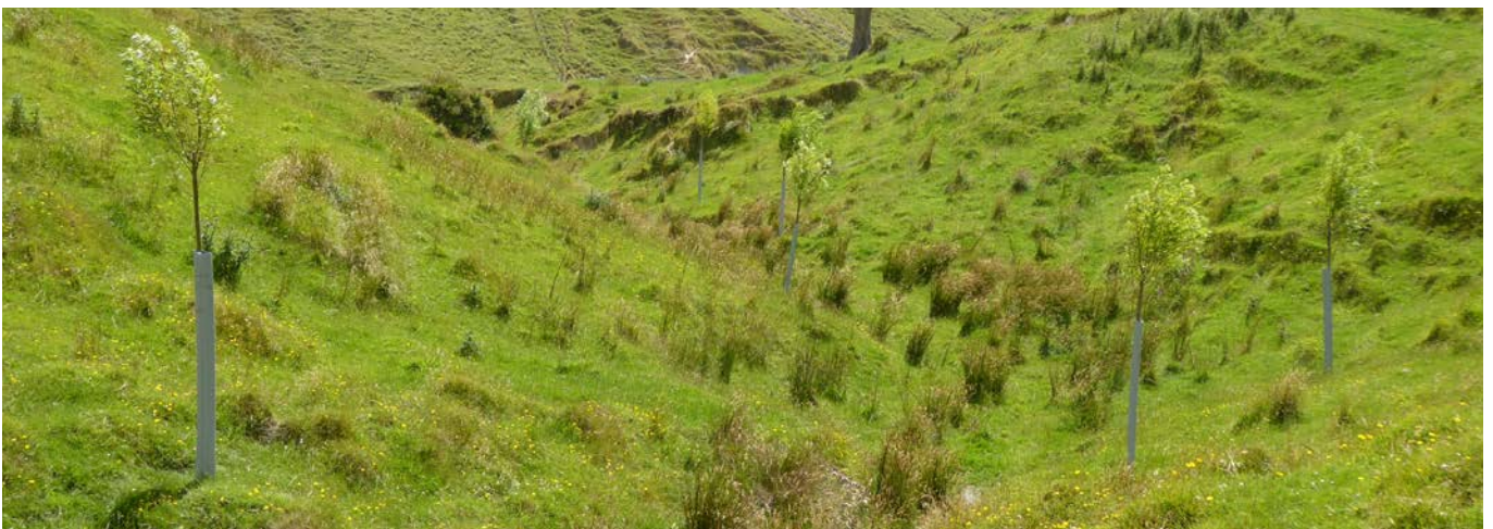
Willow poles planted up the stream