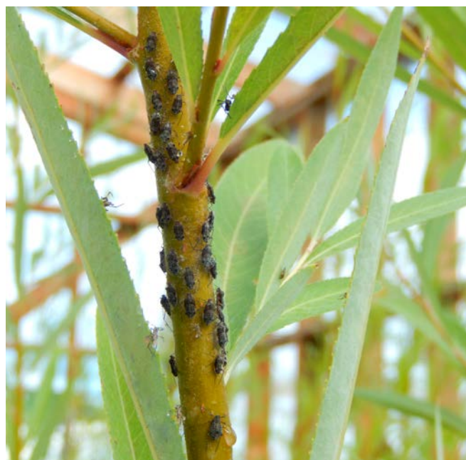
Liquid and crystallised sap excreted by feeding giant willow aphids

Older tree willows ( Salix fragilis , S. alba ) in river systems in the Horizons Region appear to be adversely affected by several seasons of exposure to GWA feeding (G Kuggelijn, personal communication). More data are needed to determine whether these trees are dead or declining, and whether the cause is GWA alone, or GWA in combination with other factors such as age, disease, possums and/ or Old Man’s Beard ( Clematis vitalba ). Individual willows harbouring GWA over winter may be more susceptible, since they may be exposed to more generations over the season.