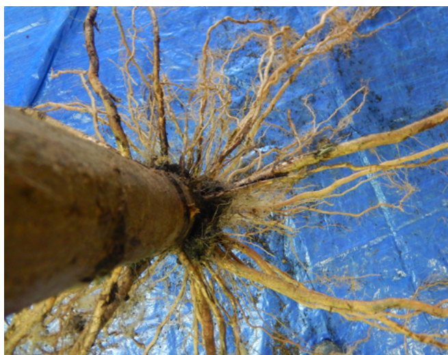
Figure 2. The excavated pumice soil root system was hung from the woolshed beam and mapped